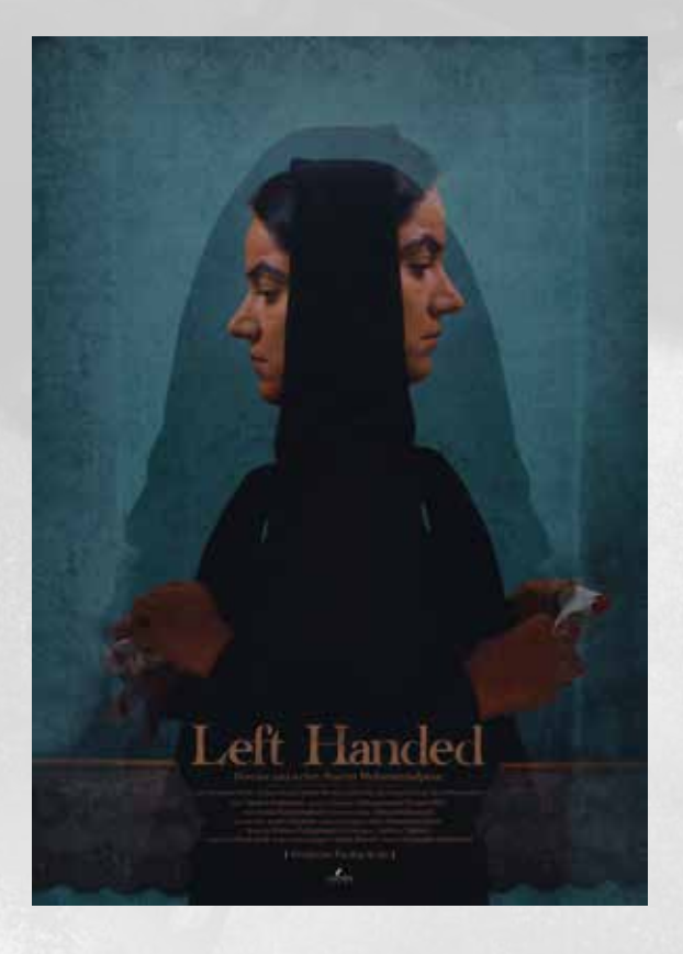
Screening Time: 17.30