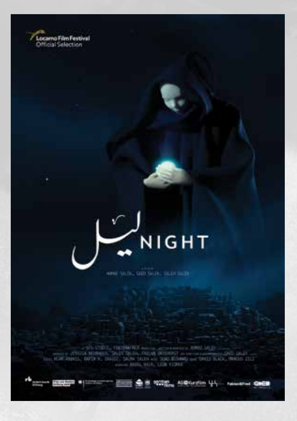
Screening Time: 14.50