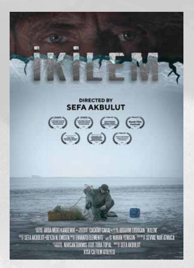
Screening Time: 16.55